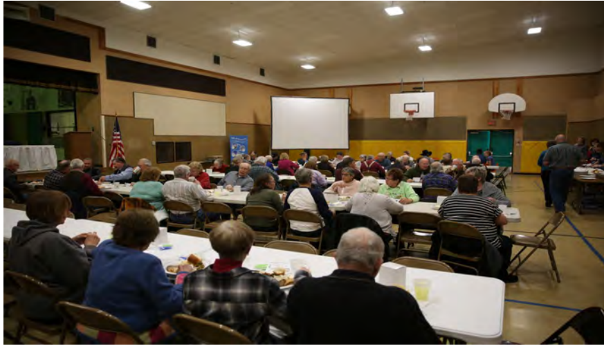
(Above) Members enjoy a Roast Beef dinner before the meeting.