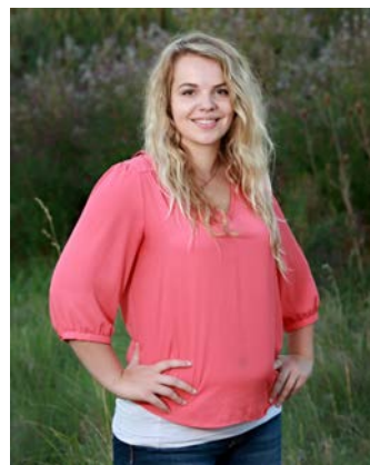
Ashley McLean R A McLean Photography