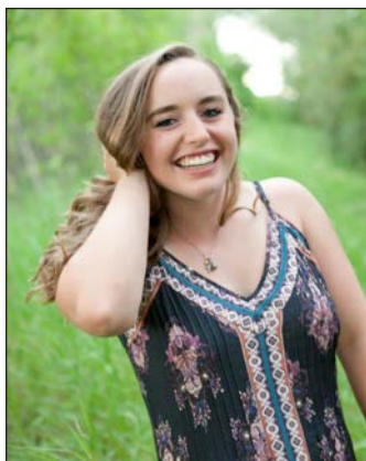
Emma Pyette